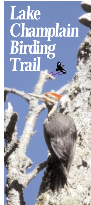
Lake Champlain Birding Trail Guide