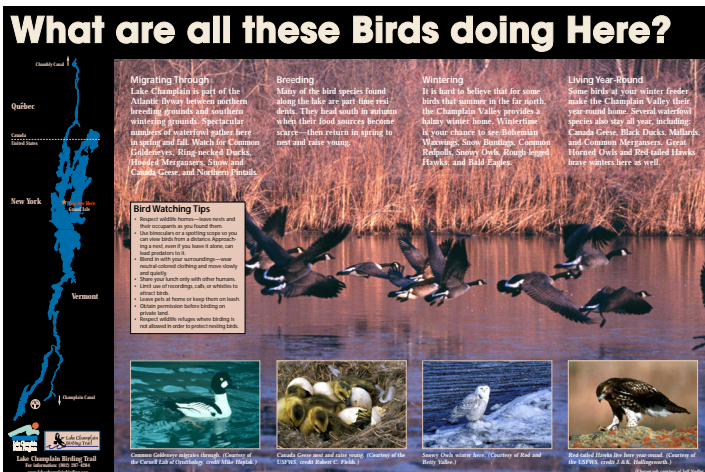
Samples of Interpretive Signs Along the Lake Champlain Birding Trail.